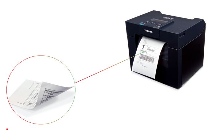
The DB-EA4D saves paper and adds value to your labels.