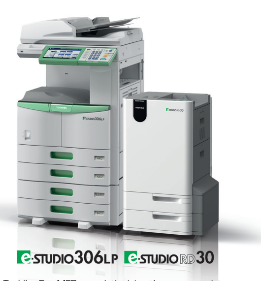
The Toshiba Eco-MFP - revolutionising the way we print. For more information on our eco product portfolio, please visit us at www.eco.toshiba.eu.